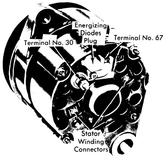
Fig. 2 MARELLI Alternator Test Points

3) Check resistance between energizing diode plug and stator winding connector. Reverse leads and check reading. If both readings are low, an energizing diode is bad.