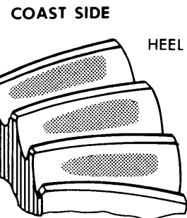
DESIRABLE PATTERN CORRECT SHIM CORRECT BACKLASH