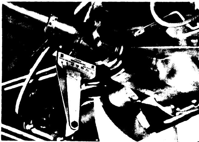
Fig. 1 Measuring Angle at Rear Propeller Shaft Bearing Cup

NOTE — Production bolt is M 10 1.5 X 35 mm. When using two or more shims, a M 10 1.5 X 50 mm bolt must be used.