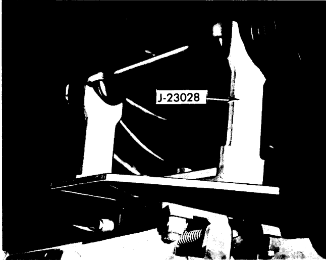
Fig. 2 Coil Spring Removal Using a Jack & Special Tool

Removal – Raise vehicle and support under frame so that control arms hang free. Disconnect shock absorber and stabilizer bar at lower control arm. Install a suitable support tool (J-23038) onto jack and position tool under lower control arm shaft so that shaft seats in grooves of tool. Install a safety chain through lower control arm and spring. Raise jack to relieve tension on lower control arm shaft and remove control arm shaft mounting bolts. Carefully lower jack until all tension is released from spring, and remove spring from vehicle.