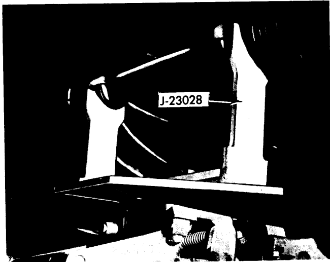
Fig. 2 Coil Spring Removal Using a Jack & Special Tool

Removal — Raise vehicle and support under frame so that control arms hang free. Disconnect shock absorber and stabilizer bar at lower control arm. Install a suitable support tool (J-23038) onto jack and position tool under lower control arm shaft so that shaft seats in grooves of tool. Install a safety chain through lower control arm and spring. Raise jack to relieve tension on lower control arm shaft and remove control arm shaft mounting bolts. Carefully lower jack until all tension is released from spring, and remove spring from vehicle.