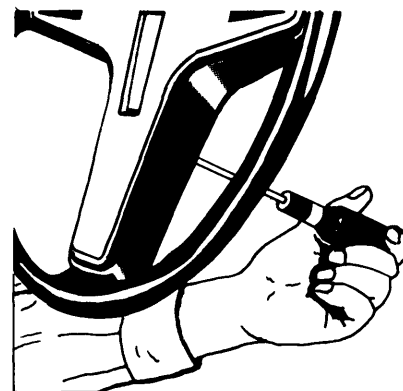
Fig. 1 Removing Horn Pad from Steering Wheel

Remove steering wheel as described above. Unscrew hazard warning knob from steering column. Remove the two combination switch retaining screws and lift assembly from steering column. To install, reverse removal procedure.